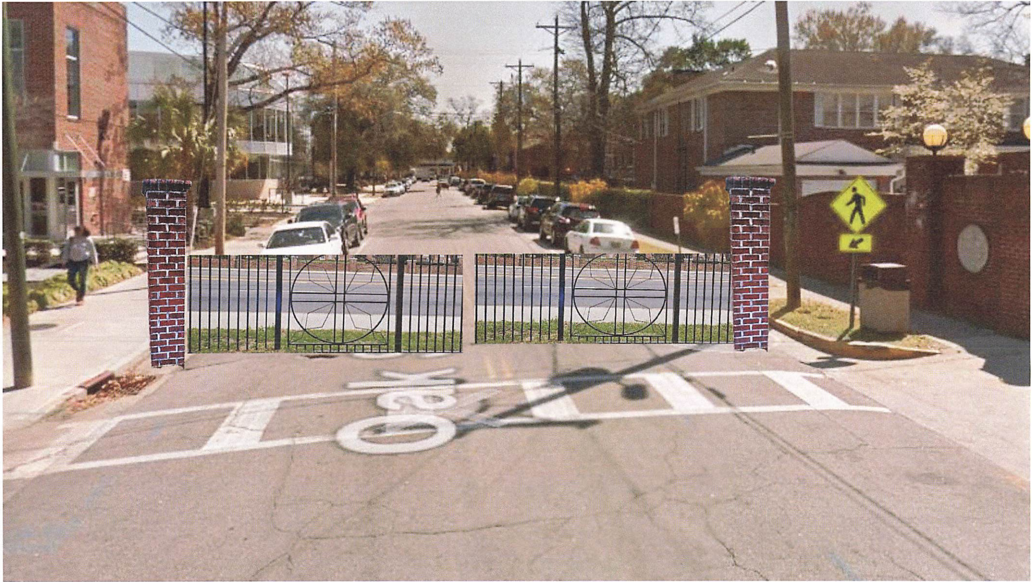
INTERSECTION AT OAK AND HASKELL STREET