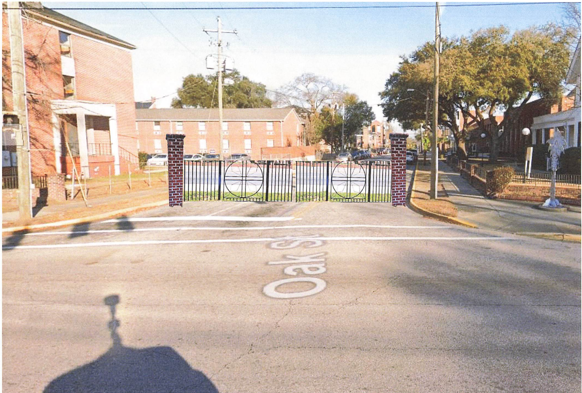
INTERSECTION OF OAK AT TAYLOR STREET