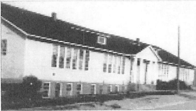
Booker Washington Heights School, 1936