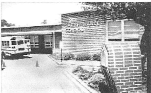
Sarah Nance Elementary School, 1999