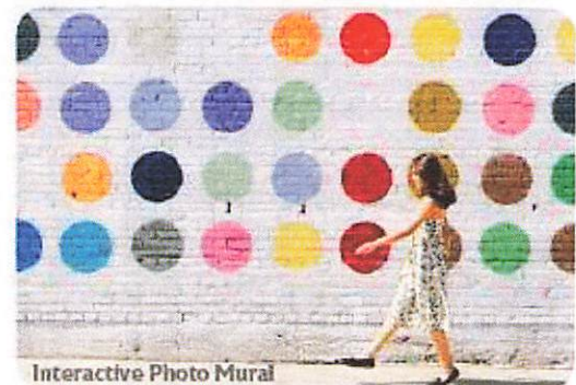
Congaree Vista Guild Public Art Placement Plan